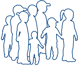
6 - 8 Friends